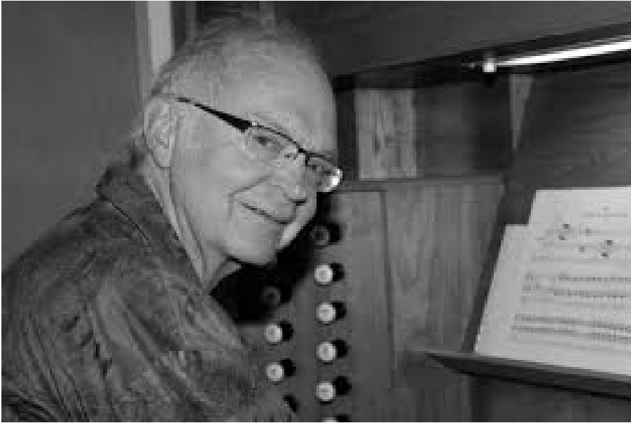
Donald Knuth of Stanford U.