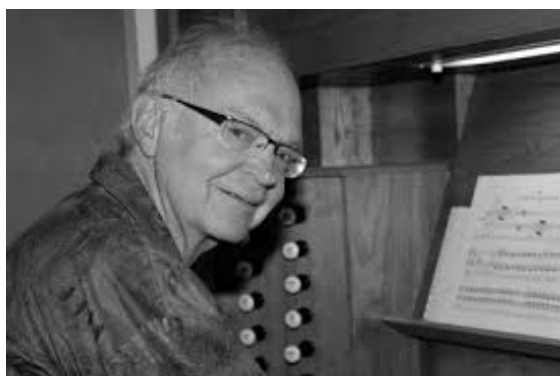
Donald Knuth of Stanford University

\text{T}_{\text{E}}\text{X} is a typesetting system— not a word-processing system—designed with mathematics particularly in mind. Certainly it processes words, but it does much more. In particular, it typesets formulae following the typographical conventions that were developed over a period of hundreds of years to make complex mathematics relatively readable to the trained mathematician, and it typesets them to the highest standards of mathematical typography. It was created by the great DONALD KNUTH and published in his beautiful work The \text{T}_{\text{E}}\text{X} book (Addison-Wesley, Reading MA, 1984).