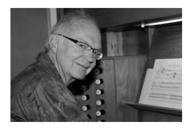
Donald Knuth of Stanford University

TeX is a typesetting system—not a word-processing system—designed with mathematics particularly in mind. Certainly it processes words, but it does much more. In particular, it typesets formulae following the typographical conventions that were developed over a period of hundreds of years to make complex mathematics relatively readable to the trained mathematician, and it typesets them to the highest standards of mathematical typography. It was created by the great Donald Knuth and published in his beautiful work The TeXbook (Addison-Wesley, Reading MA, 1984).